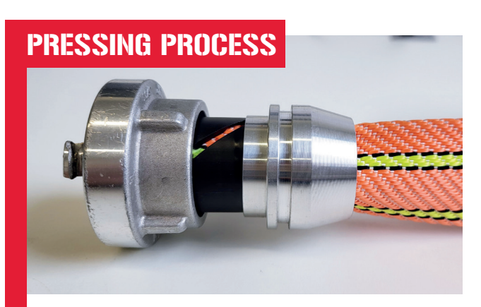
The outer ring must be placed on the inner ring by hand. The inner ring must fit exactly into the outer ring.